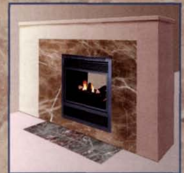
2 sided view