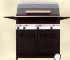
BLACK ENAMEL FINISH