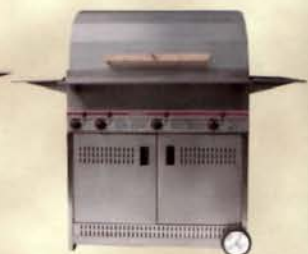
STAINLESS STEEL FINISH